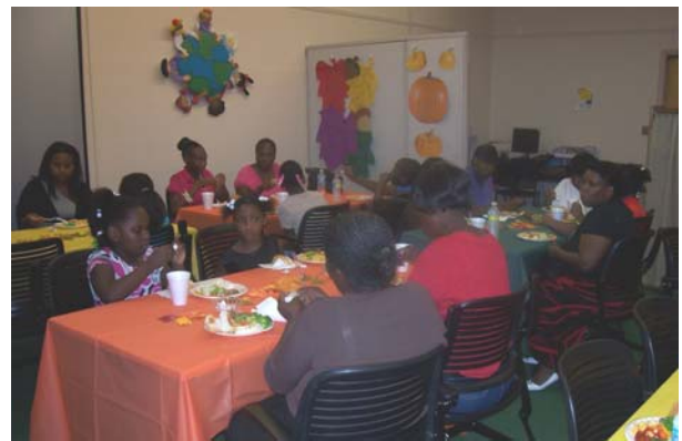
Celebration of Literacy Program Belle Glade Library