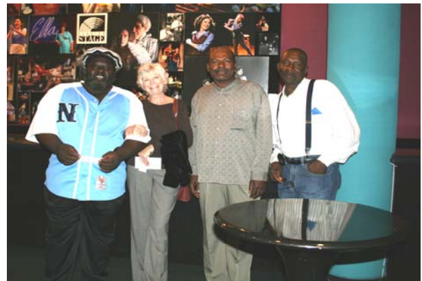
“The Bridegroom of Blowing Rock” Florida Stage