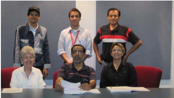
English Exchange Main Library