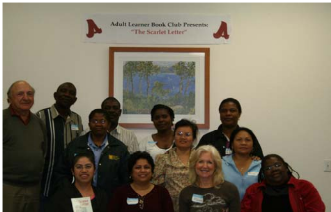
Adult Learner Book Club “The Scarlet Letter”